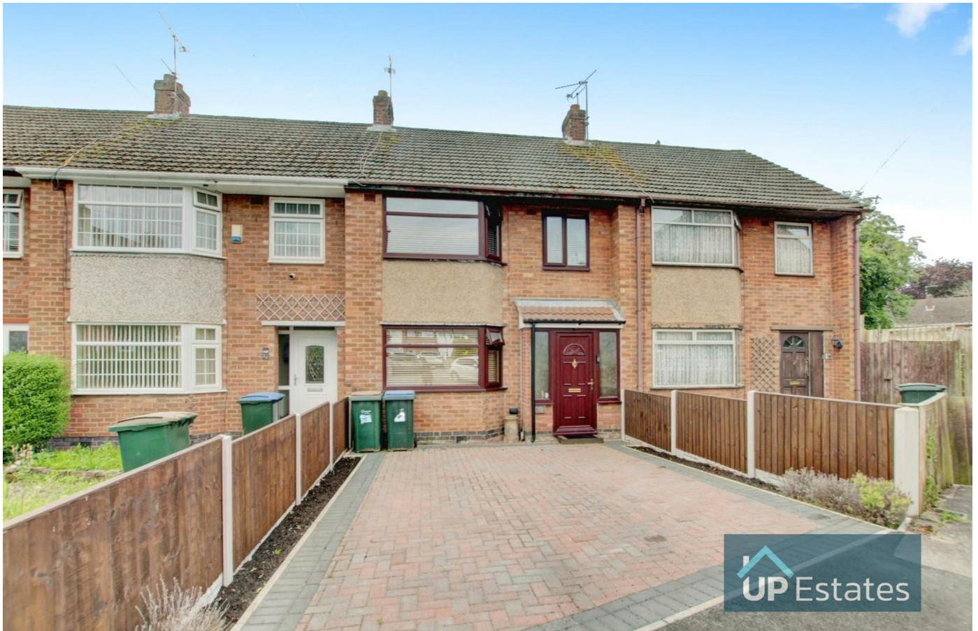
Pancras Close, Coventry